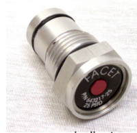
pop up indicator

Both the exteriors and interiors of the Facet 21 and 22 Series filter housings carbon steel bodies are epoxy coated to protect against corrosion. These sturdy, single cartridge housings are easy to maintain and require only 2" (51 mm) base clearance for cartridge change out.